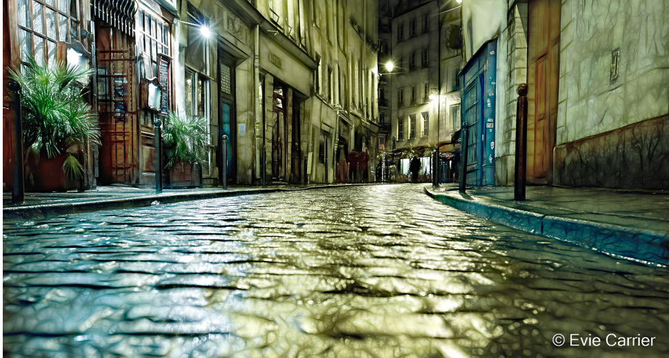
"Street View"