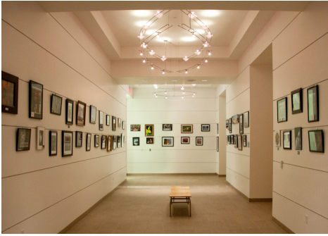
Exhibit at the Wyoming Library

The Grand Rapids Camera Club will be holding a photo exhibit at the Wyoming Public Library from February 19 - April 1, 2023. This is a great opportunity for the club to reach out to the community, and for our talented photographers to show their work. You do NOT have to be a participant in our regular print competition to participate in this exhibit. Seeing your best image(s) printed on photo paper, framed and displayed on the wall is very rewarding and satisfying. If you do not have the ability to print at home, you may use an outside lab to create your one of a kind photo art. Photo Evo, here in GR is a good place to start, and there are any number of online photo labs where prints can be made on paper, metal, acrylic or even canvas. Ready-made frames in many standard sizes are available locally at Michael's or Hobby Lobby where they are frequently on sale. After the show you will have a special image that you can display in your home or give as a gift.