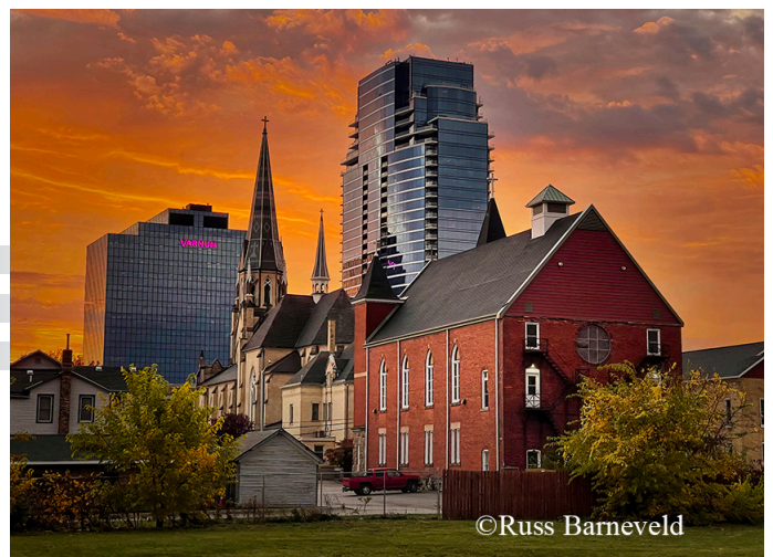
“Morning Skyline” by Russ Barneveld

The bakery is located at 610 Wealthy St. SE, Grand Rapids, Michigan.