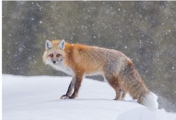
BRENT PAULL PHOTOGRAPHY Hunting Red Fox in Snowstorm - Yellowstone Winter Wildlife Safari amwestphoto.com