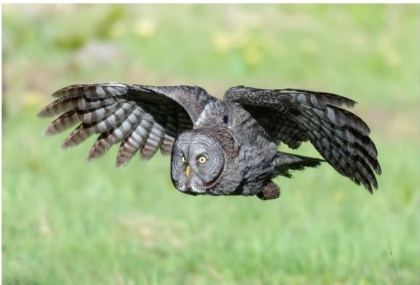
Great Gray Owl, Yellowstone National Park