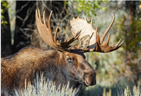
Bull Moose - YNP/GTNP Fall Safari