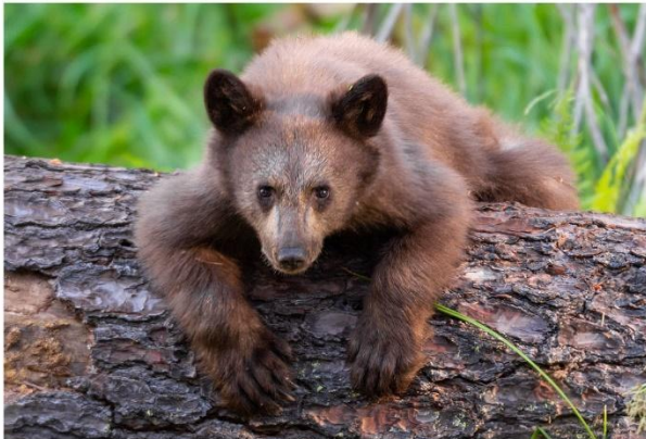
Cinnamon Black Bear Cub - chillin' - Black Bear Safari

Brent hails from Tulare, CA. He has lived throughout the west, including Montana, Colorado and Utah. He has over 38 years of experience as a professional wildlife photographer, with over 1500 magazine photo credits, 18 magazine covers, and 35 published articles. Brent has personally led over 800 photography safaris, but has also ventured outside of the wildlife genre to photograph hundreds of weddings, and thousands of families and other portraits. Brent’s photo safaris are open to all levels of skill. Whatever equipment you have right now is good enough to start with.