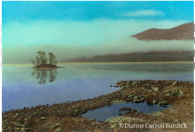
The Dream of Trees