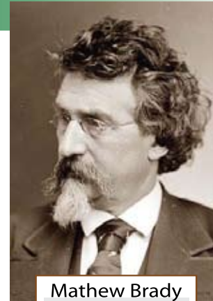
Mathew Brady 1822-1896